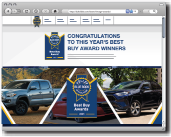
3rd Party Sites

After receiving awards, dealerships need to promote these accolades with strong and consistent messaging. If they misstate the award or what it means, dealerships risk losing public trust. Dealerships should look at their messaging from the consumer's point-of-view.